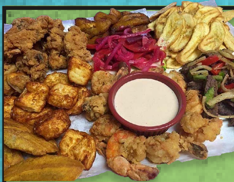
Build your own Picadera