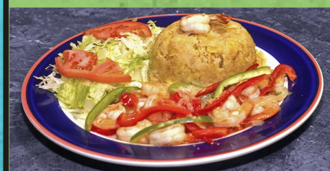
Mofongo de chicharrón con camarones al ajillo