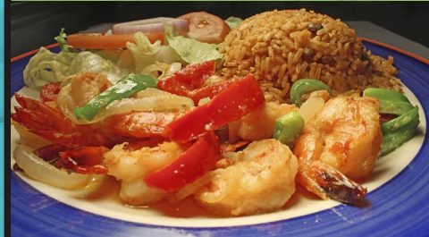
Camarones al ajillo con Moro